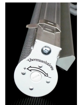
Easy adjustment system

Let's discuss your particular requirements and get your energy savings started now!