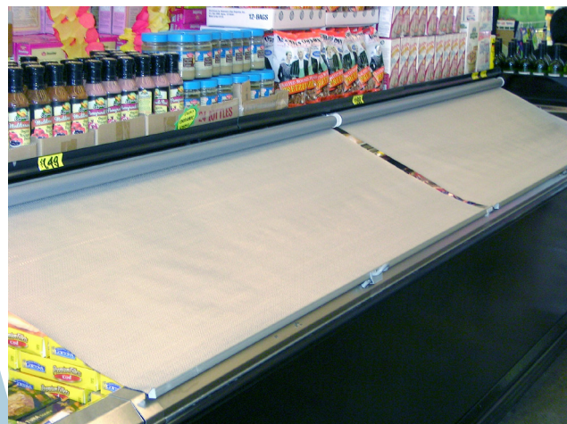
Horizontal/Island merchandiser installation mounted on the rear mullion area