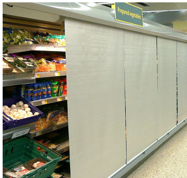
Vertical/Multideck installation inside the canopy area